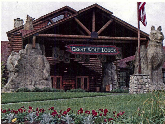
Great Wolf Lodge in Williamsburg is an expansive indoor water park packed with activities for all ages.

Our hands-down favorite activity was the highly interactive Magi-Quest, well worth the trip for that alone. It truly lives up to its name - it is downright magical. First, your wizard-in-training selects a wand (that you gallantly purchase) and has it activated (another gallant purchase.) Now the Force is with you. (Sorry, wrong movie.) A quick