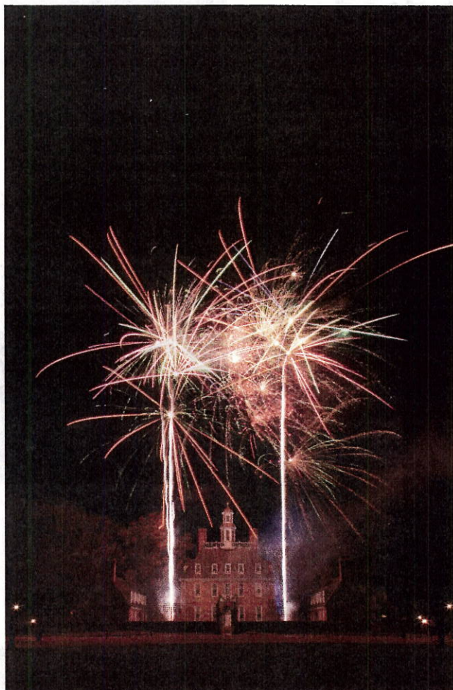
Fireworks illuminate the Governor's Palace during Colonial Williamsburg's Grand Illumination.

At the Visitors Center, be sure to shop-til-you-drop for truly unique gifts. Also be sure to seek out the "Family Fun" handout with a user-friendly map of kid-friendly activities. If your child visits three sites, he or she will receive a FREE PRIZE! (That's how I lured my son into the DeWitt Wallace Decorative Arts